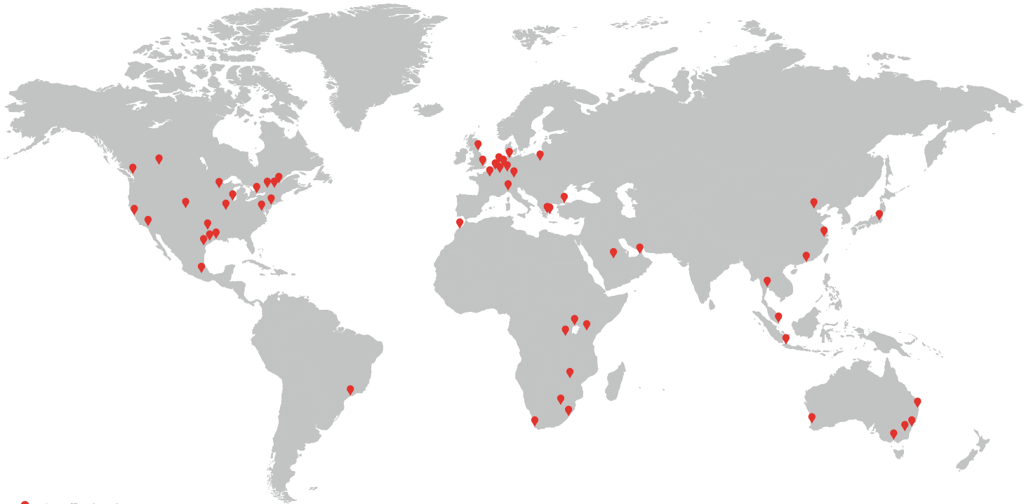
Our office locations