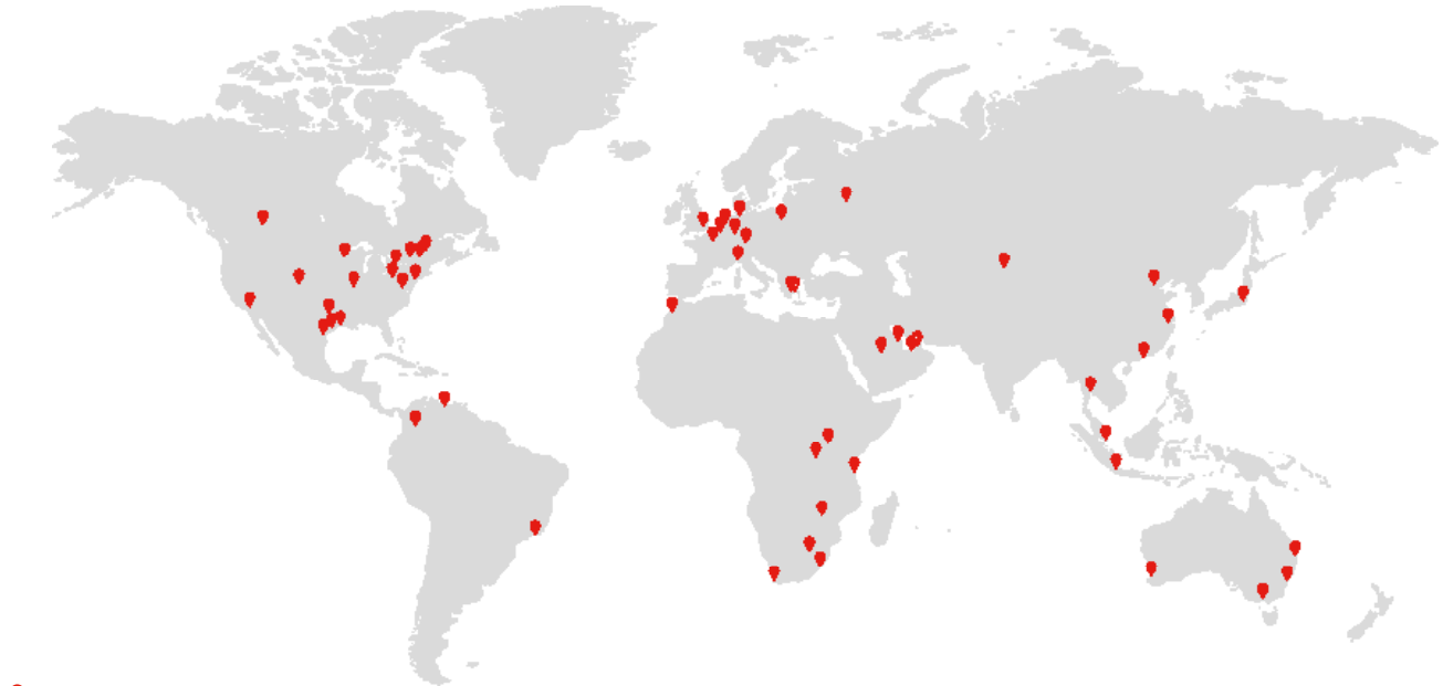
◆ Our office locations

Norton Rose Fulbright is a global legal practice. We provide the world’s pre-eminent corporations and financial institutions with a full business law service. We have more than 3800 lawyers and other legal staff based in more than 50 cities across Europe, the United States, Canada, Latin America, Asia, Australia, Africa, the Middle East and Central Asia.