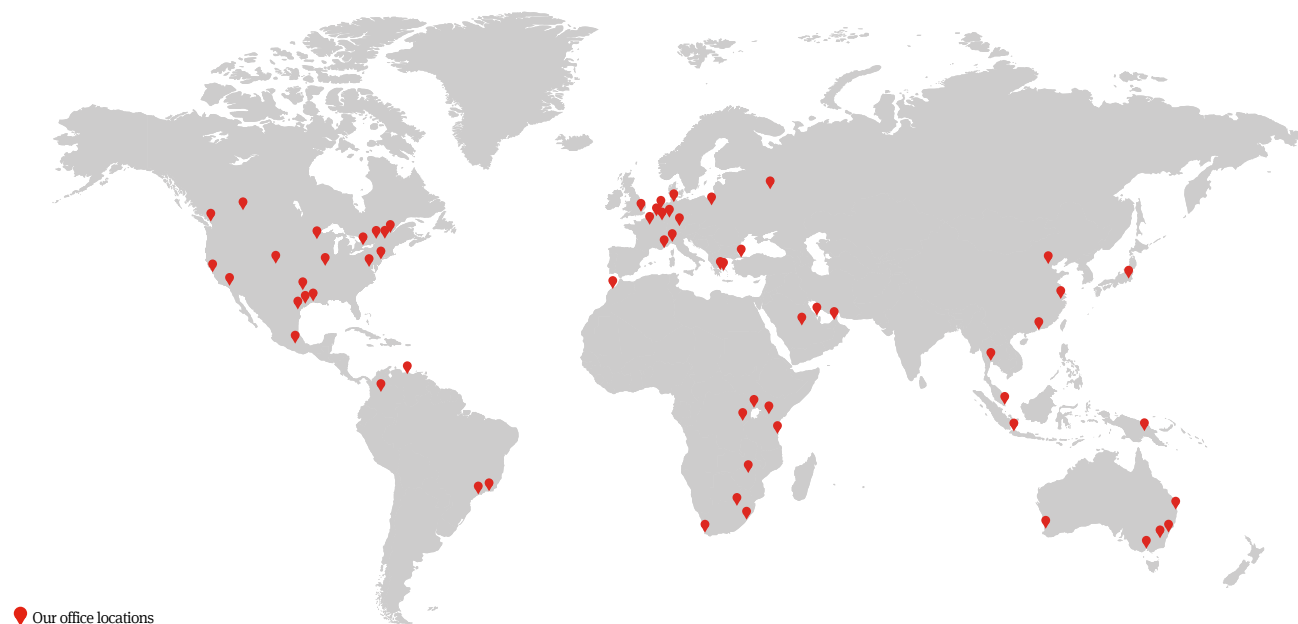
Our office locations

Norton Rose Fulbright is a global law firm. We provide the world's preeminent corporations and financial institutions with a full business law service. We employ 4000 lawyers and other legal staff based in more than 50 cities across Europe, the United States, Canada, Latin America, Asia, Australia, Africa and the Middle East.