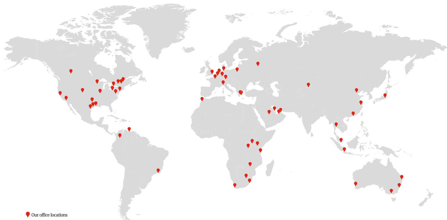
Our office locations